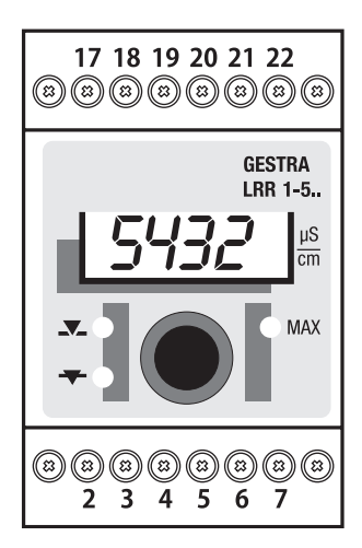
LRR 1-50, LRR 1-51